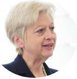
Dr. Eleni Theocharous, Member of the European Parliament

Eleni Theocharous is a Member of the European Parliament since 2009. She holds a Doctor of Medicine, Aristotle University of Thessaloniki, Greece. She is member of the Group of the European People's Party (Christian Democrats), MP-Democratic Rally 2001-2006 and 2006. She is the Chair of Committee of Health, Vice Chair of the Committee of Foreign Affairs, Cyprus Parliament. She received her degree from the Faculties of Medicine and Philosophy of the Aristotle University of Thessaloniki and continued to postgraduate studies in paediatric surgery in Manchester and Paris. She received her Doctor of Philosophy (Ph.D.) degree from the Democritus University of Thrace and later continued postdoctoral studies in Boston (B.C.E.T.S.). She is a member of the American Trauma Academy. In 1991, Theocharous was elected Assistant Professor of Paediatric Surgery at the Democritus University of Thrace. She has been a member of the High Directorate of the "Médecins du Monde" international organization and director of medical, environmental and provisionary projects of the International Aid Fund in Brussels. She is a well-known Poetess in Cyprus and Greece - twice First State Poetry Award, Human Rights activist for the last 25 years, volunteer surgeon in war and natural catastrophes fields. She is a Visiting Professor in many universities, in Asia teaching Paediatric Surgery. In addition, she worked on projects in the sub-Saharan Africa for AIDS prevention and treatment.